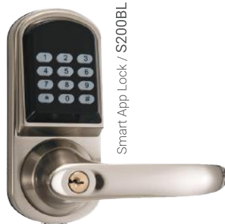
Smart App Lock / S200BL