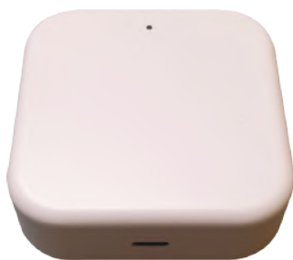
Wifi Hub / S651