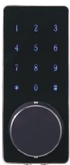
Smart App Lock / S110